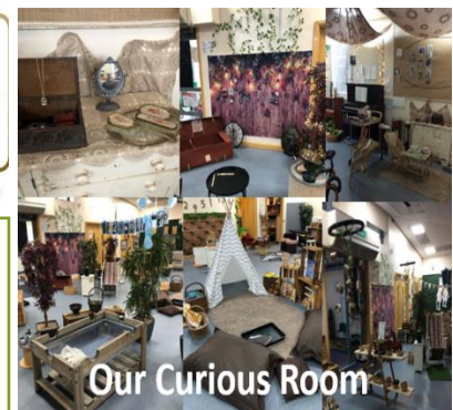
Our Curious Room

Did you know we are an accredited setting? The only school in the North of England.